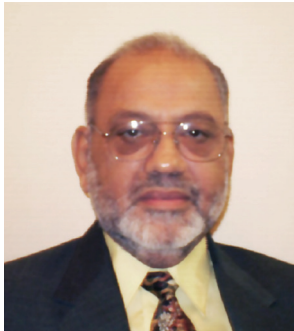
The Editor, Parsi Junction.