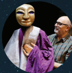
Dadi Pudumjee Padma Shri Puppeteer, Founder, Ishara Puppet Theatre Trust