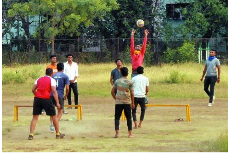
Sports enthusiasts play a volleyball-like game at a city ground on Wednesday evening.