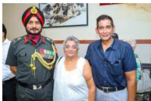
The Defence personnel and Civilians jointly paid homage to the Field Marshal and a wreath laying ceremony was also conducted.