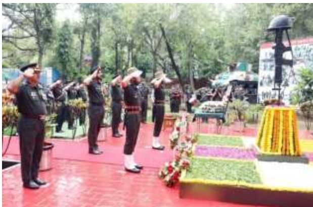
On the occasion of the death anniversary of Field Marshal Sam Maneckshaw, MC a combined tribute by the Defence Forces and Civilians was paid on 27/ Jun/2022 at Shaheed Smarak, Colaba Military Station, Mumbai.